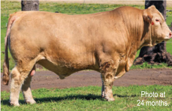
Photo at 24 months.

Big strong large footed bull, deep bodied with plenty of looseness of hide and extra fine hair type. Fast becoming our highest growth bull, top 1% of breed for all growth traits, all positive Carcass traits, PP polled and red.