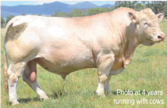
Photo at 4 years running with cows.

Purchased originally as a heifer bull he has proven himself in that role, and breeds enough carcass and performance out of many cows that his sons always attract attention at our sales.