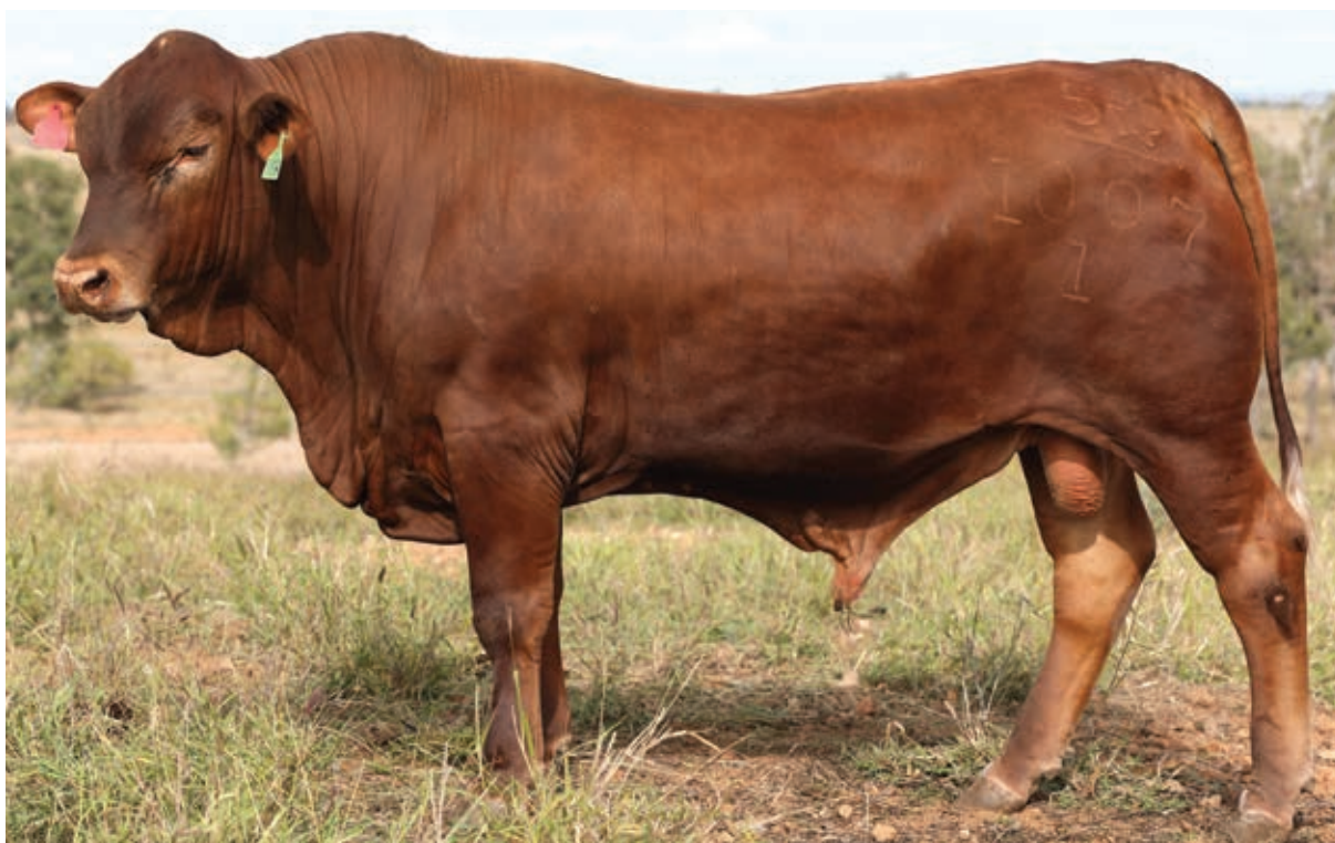
5 STAR 211007

Moderate growth Sire with smaller birth weight EBV. 38cm scrotal with 70% motility. Clean coated sire, very good temperament, Dam is due to calve with 3rd calf in 3 years in November.