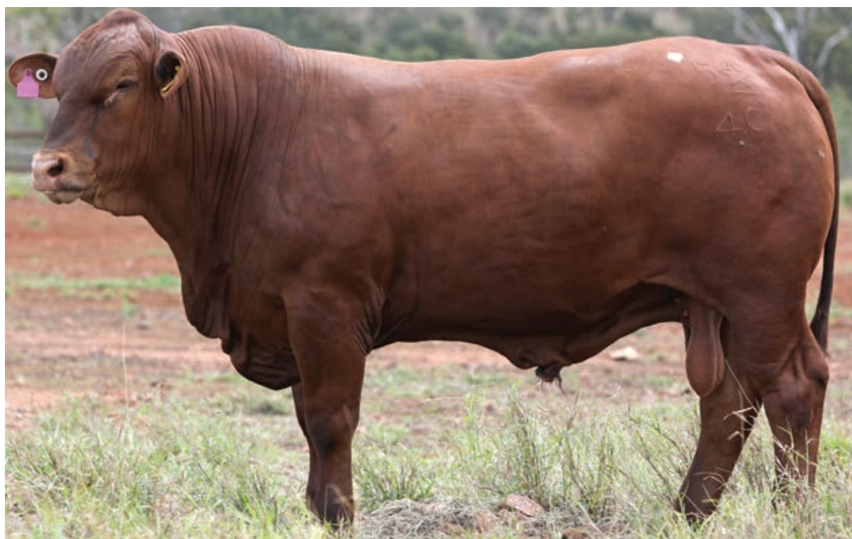
5 STAR 210040

37cm scrotal with 85% motility and 89% morphology. Eye catching son of 650, who covers all bases. Beautiful temperament. Sire DNA verified.