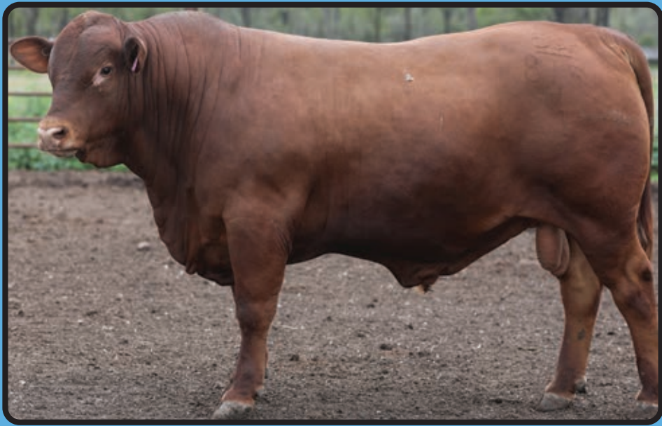
LOT 6, 5ST210815