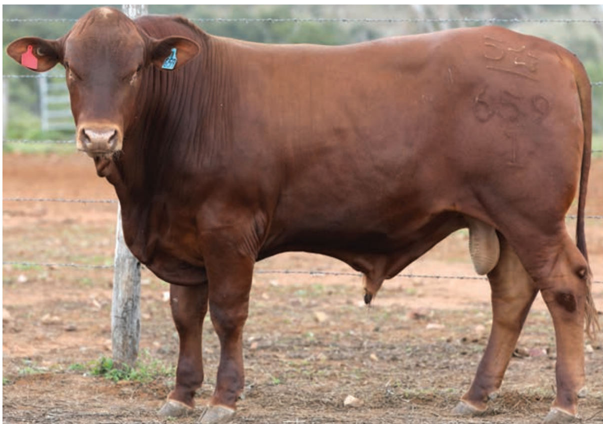
5 STAR 210659

Top 20% for 600 day growth. Top 20% for 400 day growth. Top 15% for 200 day growth. 38cm scrotal with 90% motility and 81% morphology. Sire is DNA verified.