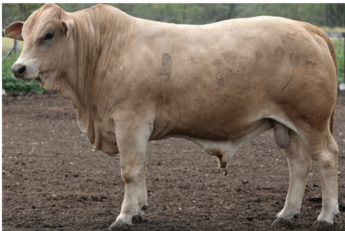
5 STAR 210900

One of my favourites. The G.B.V information has not returned in time for the catalogue print. But 900 is an impressive carcass bull. Not only does he display good muscle pattern but he has good finish or good even fast cover the rib to the rump. I think a lot of this bull.