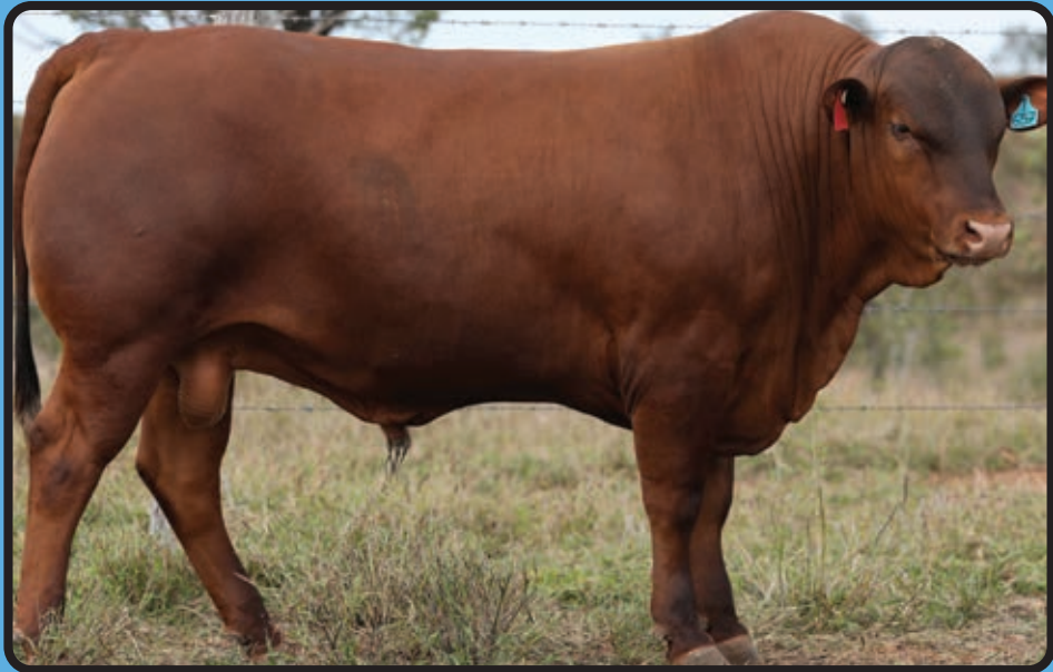
LOT 35, 5ST210657