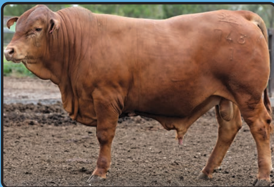
LOT 4, 5ST210745