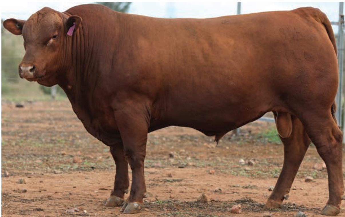
5 STAR 210114

This bulls actual performance has been outstanding. Ranked 1st in the 60 day feed trial from 54 other bulls. His weight gain was 15% ahead of the 2nd p;aced bull and 55% of the average of his group. 38cm scrotal, 75% motility and 91% morphology.