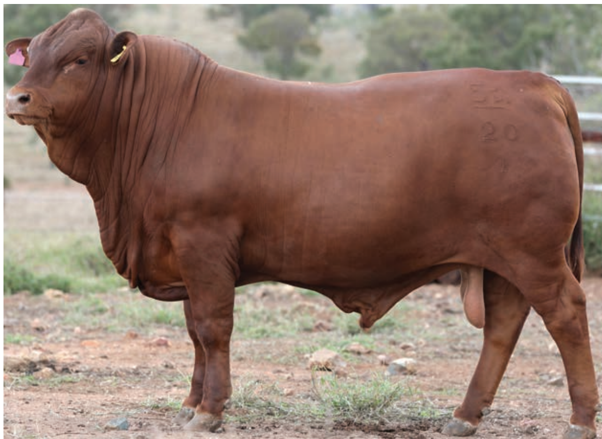
5 STAR 210020

Top 15% for 600 day growth EBV. Top 10% for 200 day wean EBV. 75% motility with 78% morphology. Good capacity young sire with high yielding muscle pattern with good finishing ability. Top 9% rebreed in a yield sire is not always easy to identify. Sire is DNA verified.