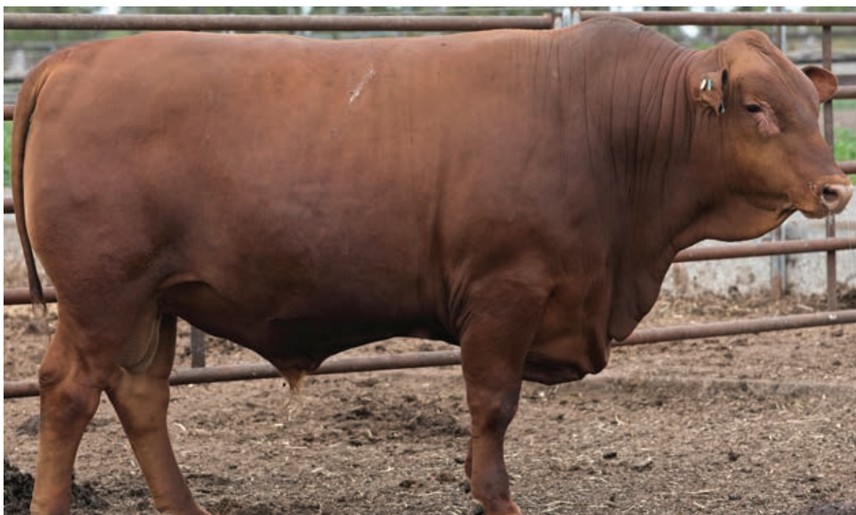
5 STAR 211116

Long, thick set sire with good capacity. Outcross genetics. Ranked 3rd out of 76 bulls for 60 feed trial.