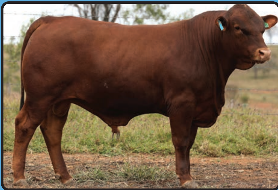
LOT 59, 5ST210881