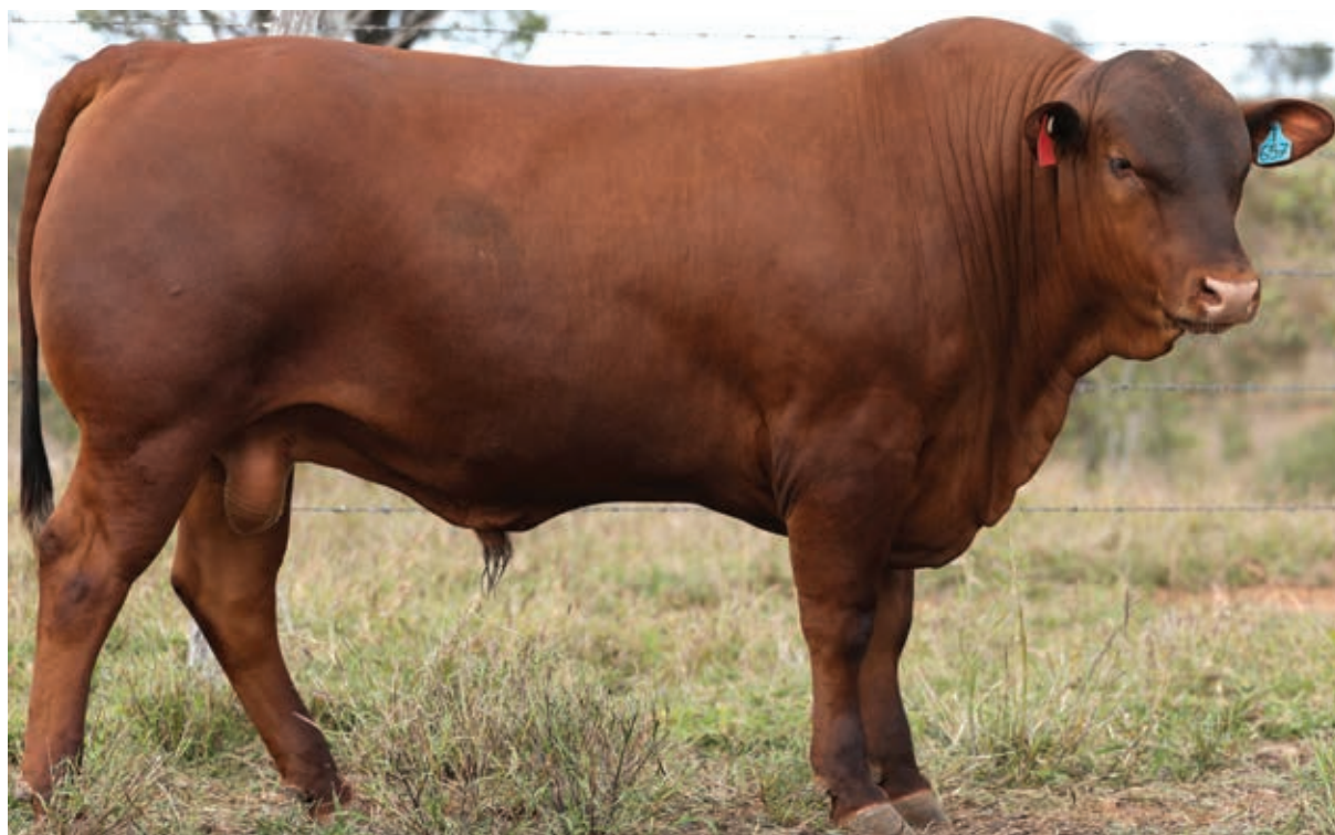
5 STAR 210657

Another example for the "Pea in a Pod" trait of 5 Star 130022. Sire is DNA verified.