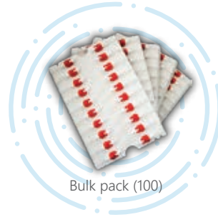
Bulk pack (100)

Questions? 1300 138 247 or contact@allflex.com.au