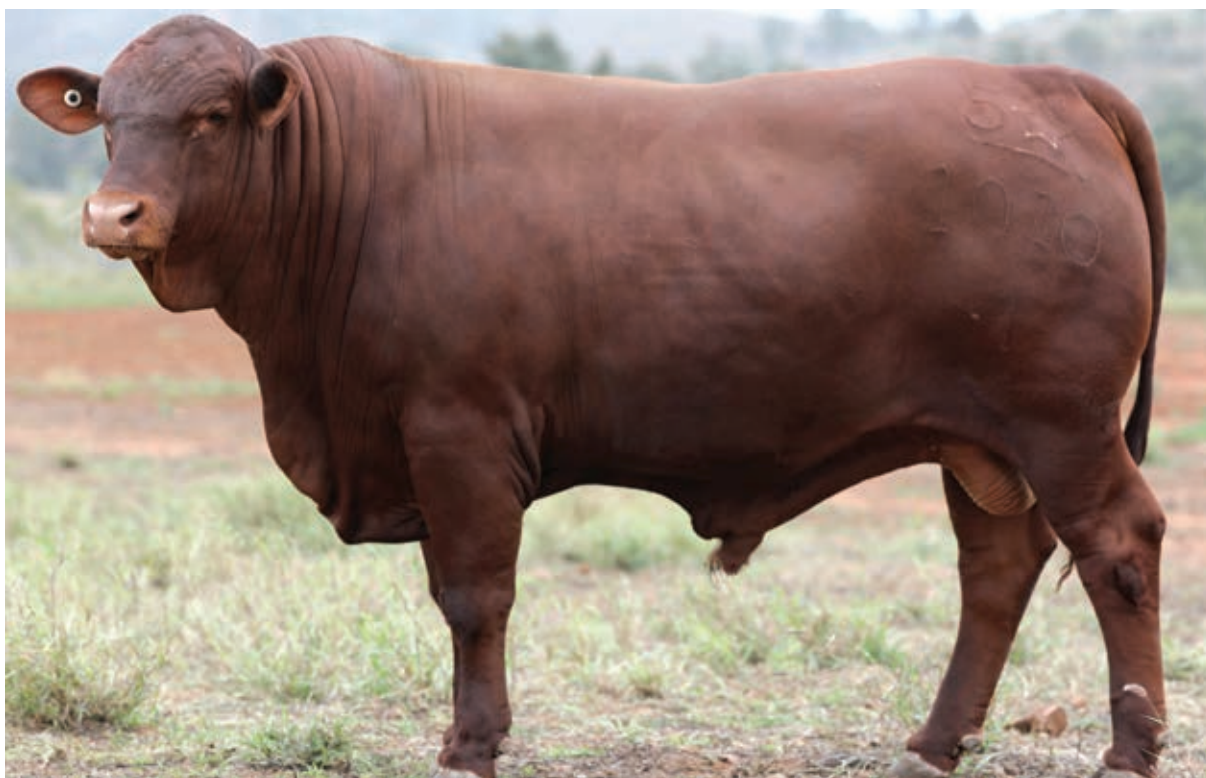
5 STAR 211010

Low birth wt EBV, AMD Grand Sire on the Dam Line, is 13-22. Not a surprise, to see 1010, was sired by a Yearling Bull out of a yealing conceived Dam! 38cm Scrotal, with 95% Motility with 87% Morphology.