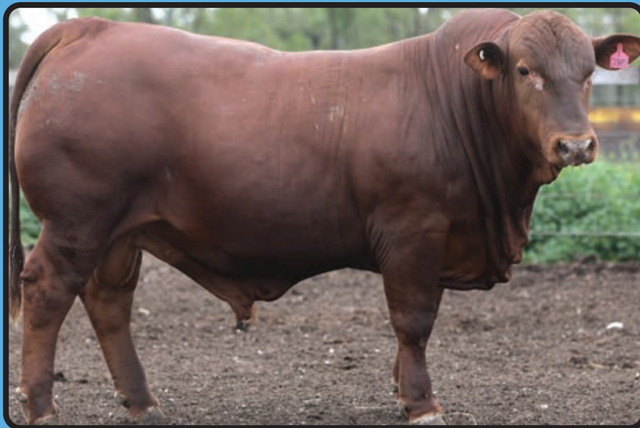
LOT 5, 5ST210745