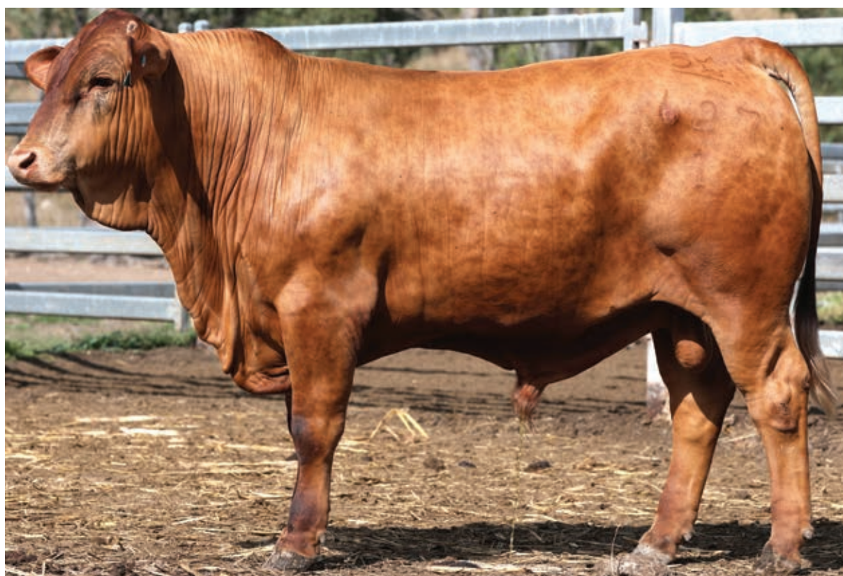
5 STAR 210627

Top 10% for 600 day growth EBV. Top 10% for 400 day growth EBV. A Lighter coloured sire with great carcass shape, fleshing and yield capacity without semen scarifying mobility. 95% motility. Sire DNA verified.