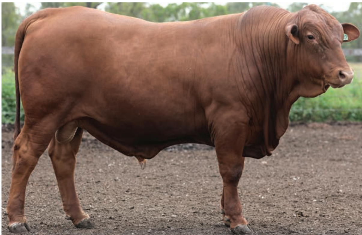
5 STAR 211222

Top 10% for weaning weight EBV. Out of a fertile 1st calf heifer, calving down at 2 years and in calf again.