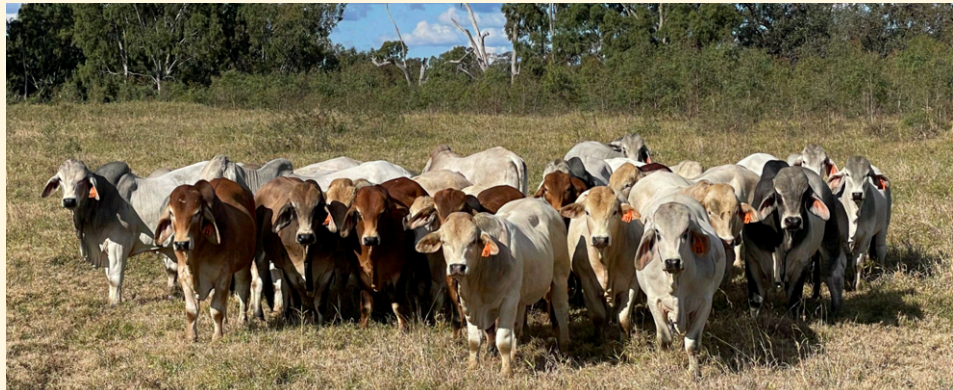
WHITAKER BEEF BULL SALE