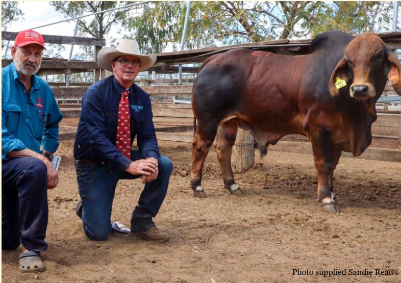
WBBS 2021 (Lot 27) Equal Top Price Bull $12,000 to Hacon Pastoral Co