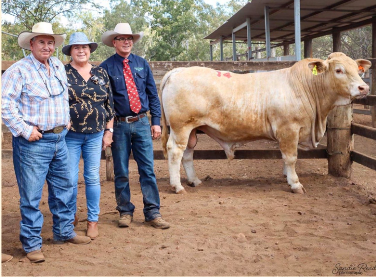
WBBS 2021 (Lot 14) Equal Top Price Bull $12,000 to Hocking and Clarke