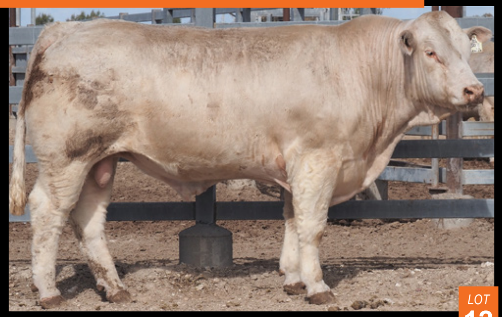
Big strong bulls adding $$$ in 3 Ways: Extra Charolais growth, the flatback premium and higher calving % from higher libido.