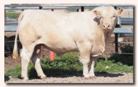
Our top priced bull at our Roma 2022 Sale Glenlea Louis R305E (P) Lot 4 Sold for $32.000