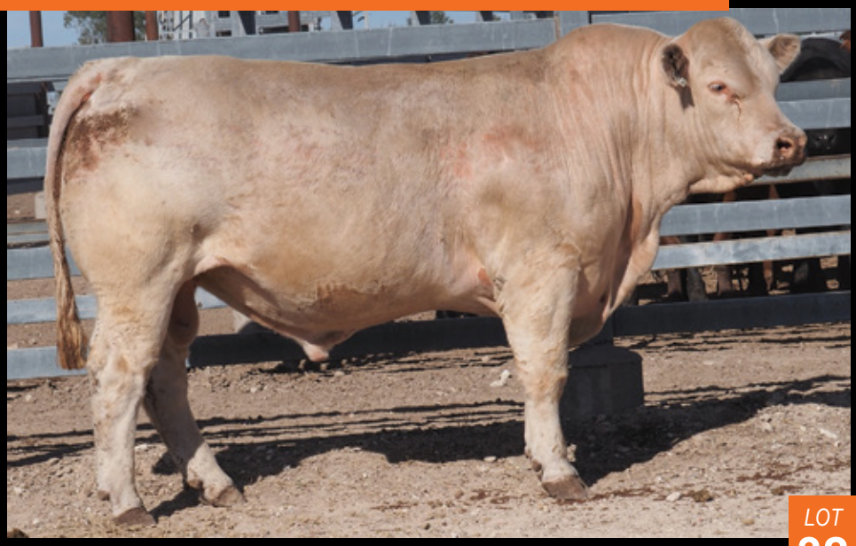
Quality from the first lot to the end of the draft.