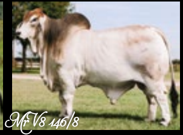
Mr V8 146/8