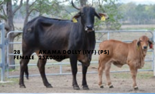
28 AKAMA DOLLY (IVF) (PS) FEMALE 25A0508F