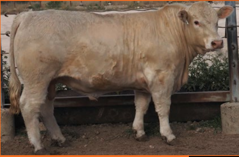
Lot 56 Yearling