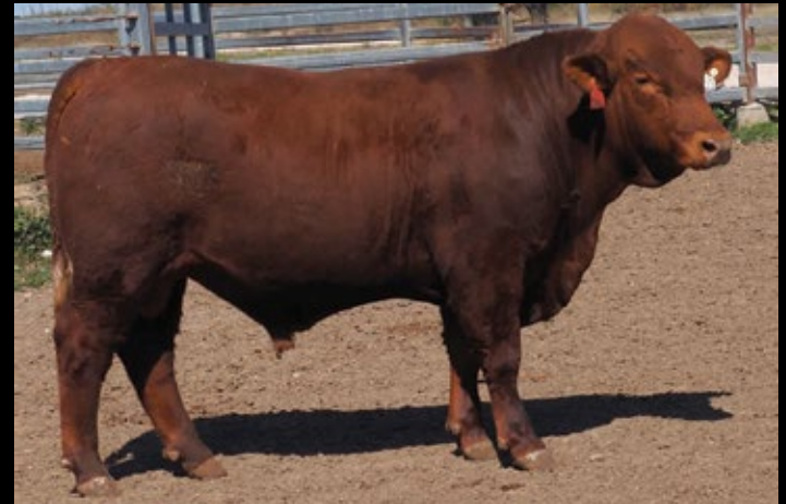
LOT 15 Polled Charolais / Santa Composite Bull