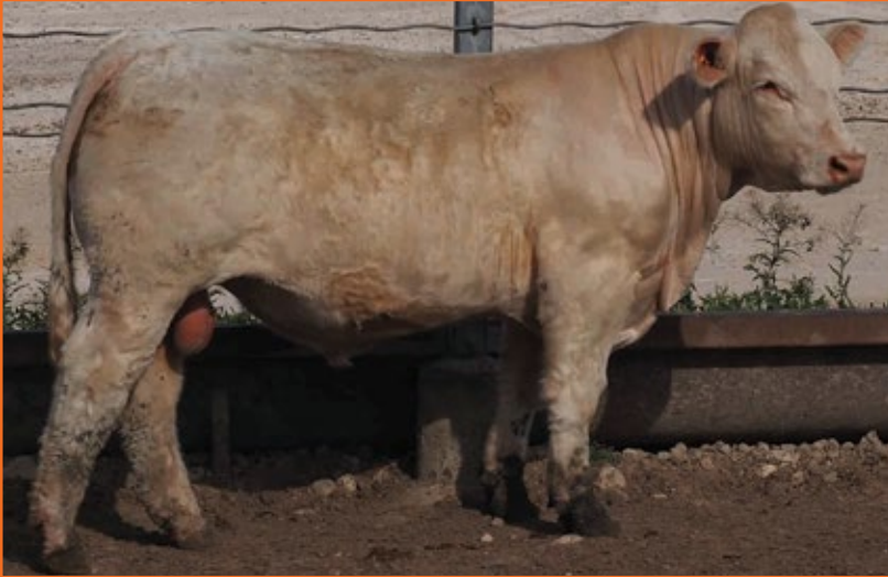
Lot 59 Yearling