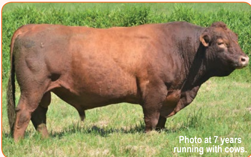
Photo at 7 years running with cows.

DAM: GLENLEA JANET U6E (GLE U6E) (R/F) (P) (TW)