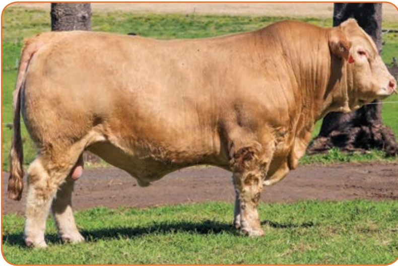
Sire of lot 33.