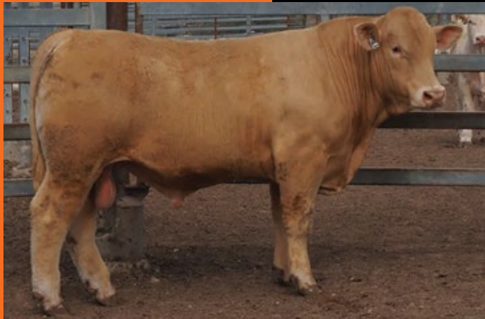
LOT 16 19 months