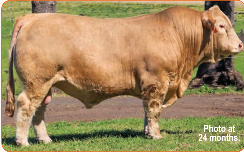
Photo at 24 months.

DAM: VALLEY VIEW ESTELLA 416 (VLWH26E) (AI) (ET) (P)