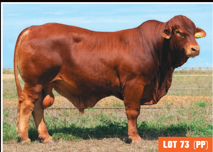
LOT 73 (PP)