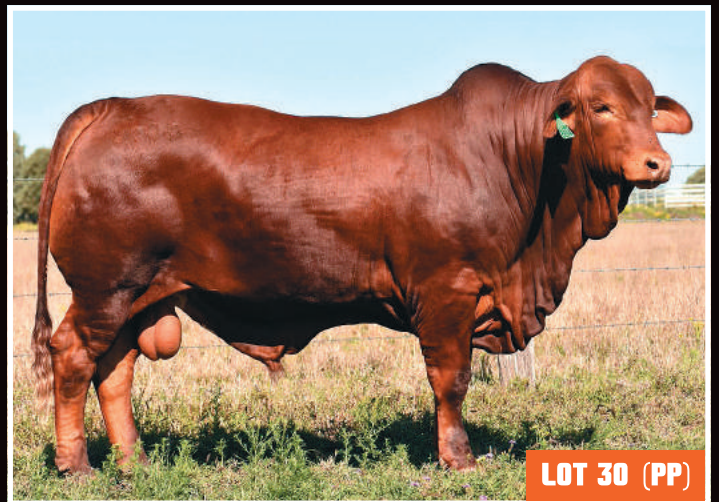
LOT 30 (PP)