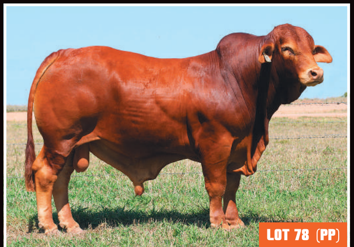
LOT 78 (PP)