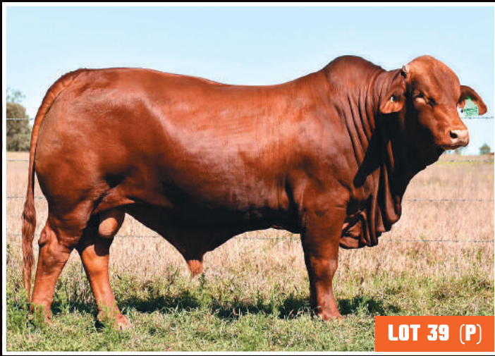
LOT 39 (P)