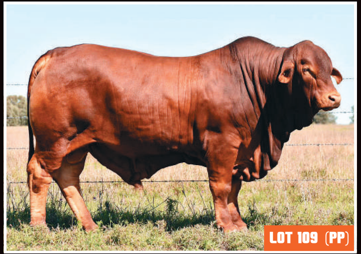
LOT 109 (PP)