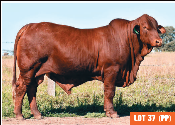
LOT 37 (PP)