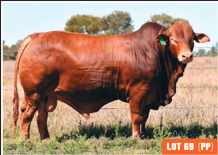
LOT 69 (PP)