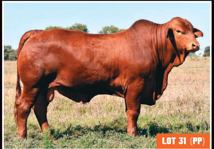
LOT 31 (PP)