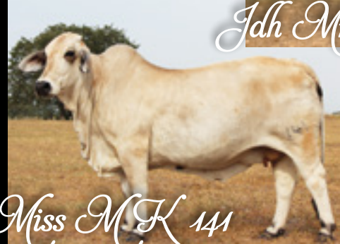
Miss MK 141