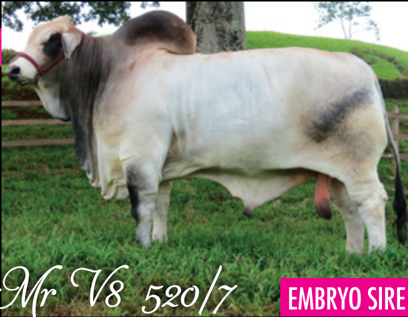
Mr V8 520/7